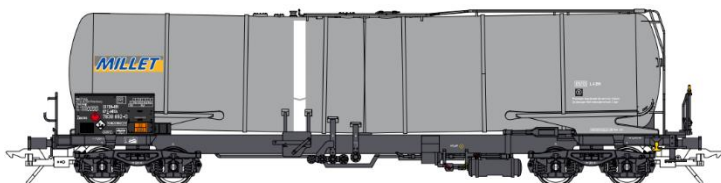
42323-30 Tank-car Zacns, operated by Millet

Modern petrol tank-cars 95 m3 – delivery March 2024