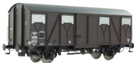
42245-04: SNCF K 340 689

UIC SNCF vans (wood sided) type Gs4-01 – delivery February 2024