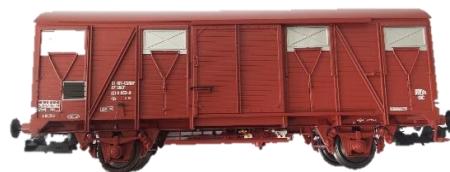
42245-06 : SNCF 87 121 3153-3

Modern petrol tank-cars 95 m3 – delivery March 2024