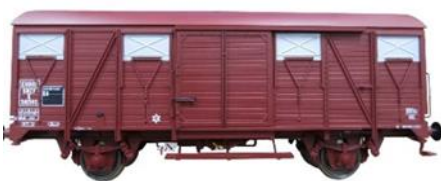
42245-05 : SNCF K 343 274