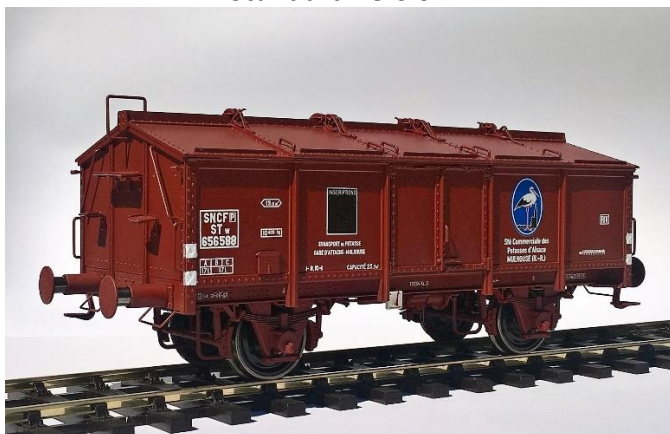
Price : 149,00 TTC