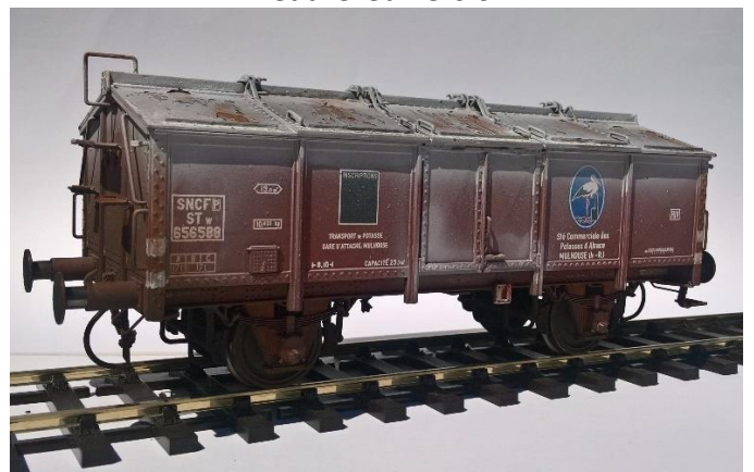
Price : 169,00 TTC