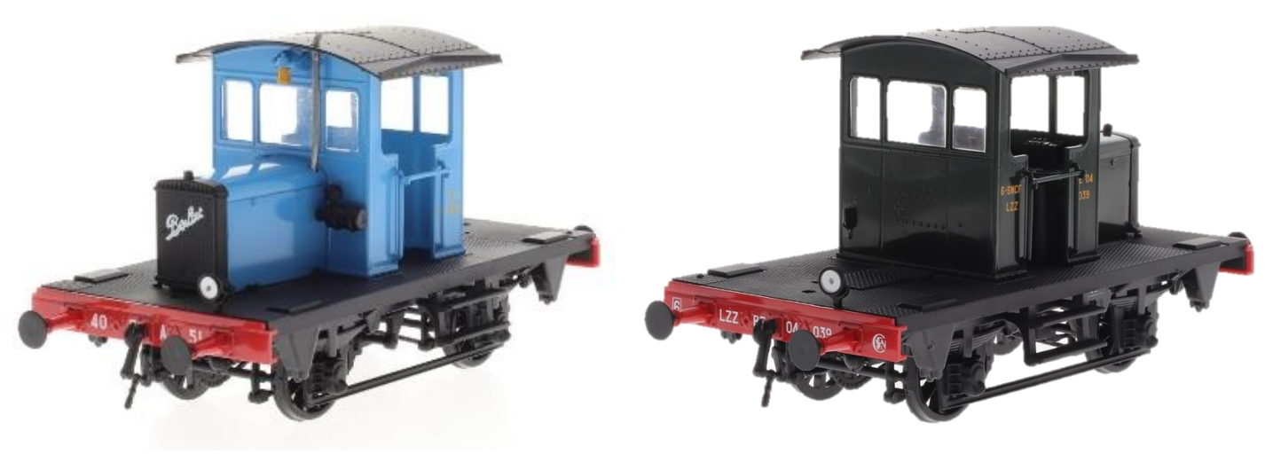
PLM 1924 SNCF 1950

CHREZO offers you two liveries of this 1/43 scale model (154 mm overall length):