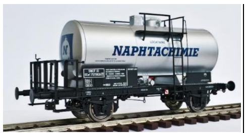
Réf. 37265 : SNCF / Naphtachimie, era 3.