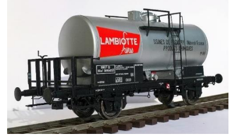
Réf. 37266 : SNCF / Lambiotte, era 3.