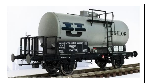
Réf. 37264 : SNCF / Ugilor, era 3.

During QUAI ZERO show, and only on site, we offer each of our 3 SNCF exclusives tank-cars discounted at 110,00 € unit price, incl. VAT (Vs 115,00 € retail price). Just enjoy to receive your entry ticket price by refund!