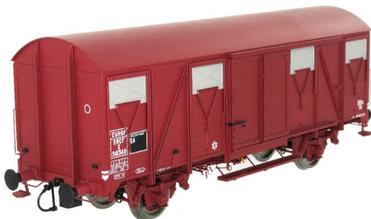
42245-05 : Intermediate livery UIC red Running number SNCF K 343 274

A third item Lenz 42245-06 is displayed in UIC red livery with UIC letterings (SNCF 87 121 3153-3) and will be available in Lenz standard assortment.