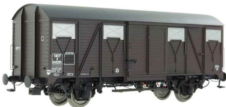
42245-04: Genuine livery, Dark brown livery with black roof and chassis. Running number SNCF K 340 689

Delivered to the SNCF between 1957 and 1960, the Gs4-01 2-axles covered vans were built according to the UIC standard and remain essential to the freight traffic evocation from 1958 to 1990. With Lenz, we have decided on an exclusive reissue of these models released in 2016, but with new running numbers: